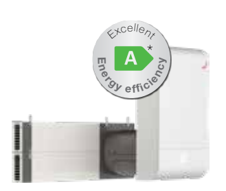
ComfoAir 70 with reveal module