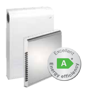
ComfoAir 70 with stainless steel outside wall panel