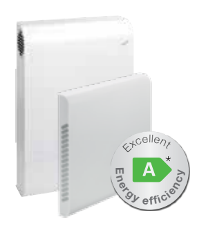
ComfoAir 70 with white aluminium outside wall panel

Zehnder ComfoAir 70 can be installed with various outside wall hoods or a reveal module for almost invisible integration of the external and exhaust air ducts in the window reveal.