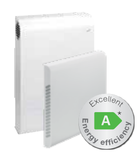
ComfoAir 70 with plastic outside wall panel